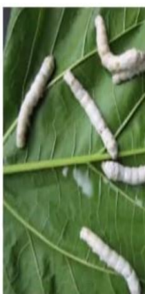
Figure 2. Oozing