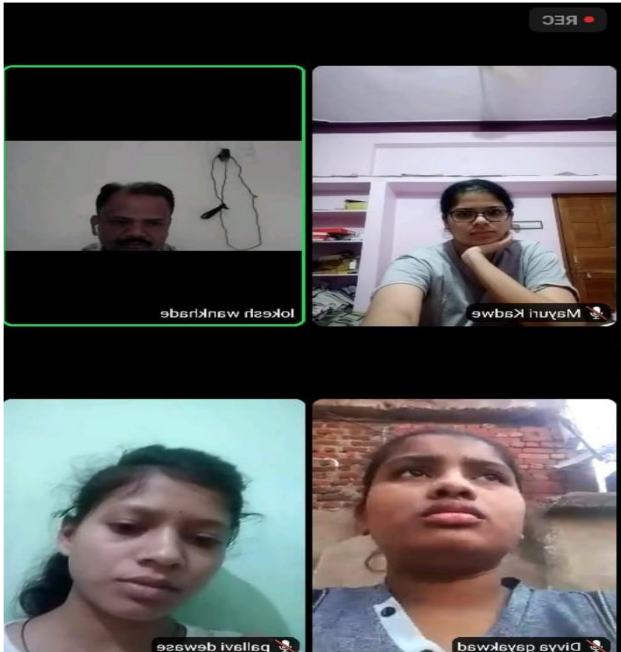
Online Classes of “Certificate Course in Sericulture” on Zoom Meet

practical classes. The practical knowledge of mulberry, the food plants of mulberry silkworm, Bombyx mori was given to the students online by showing them different you tube videos of mulberry cultivation, mulberry diseases management, pruning etc. The practical knowledge of silkworm rearing was also given to the students online by showing them different you tube videos of silkworm rearing , silkworm disease management, harvesting, Post cocoon operation and marketing.