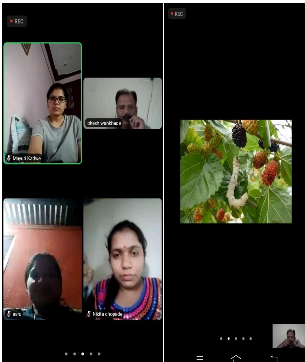
Online Classes of “Certificate Course in Sericulture” on Zoom Meet