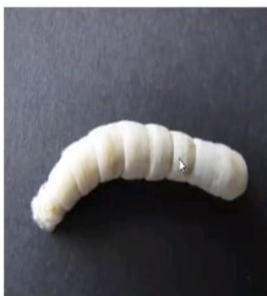
Figure 1. Grasserie larva