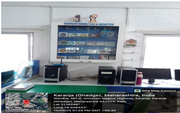
Educational CDs & Cassettes