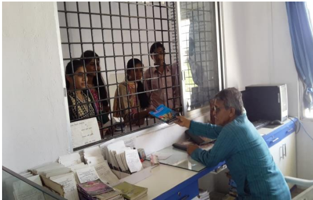
Book Issue Centre