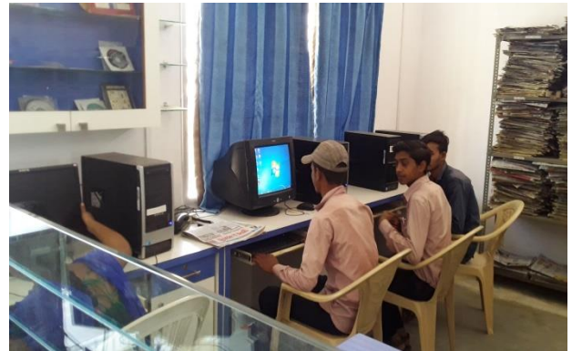
IT Zone (Student Using Computer)